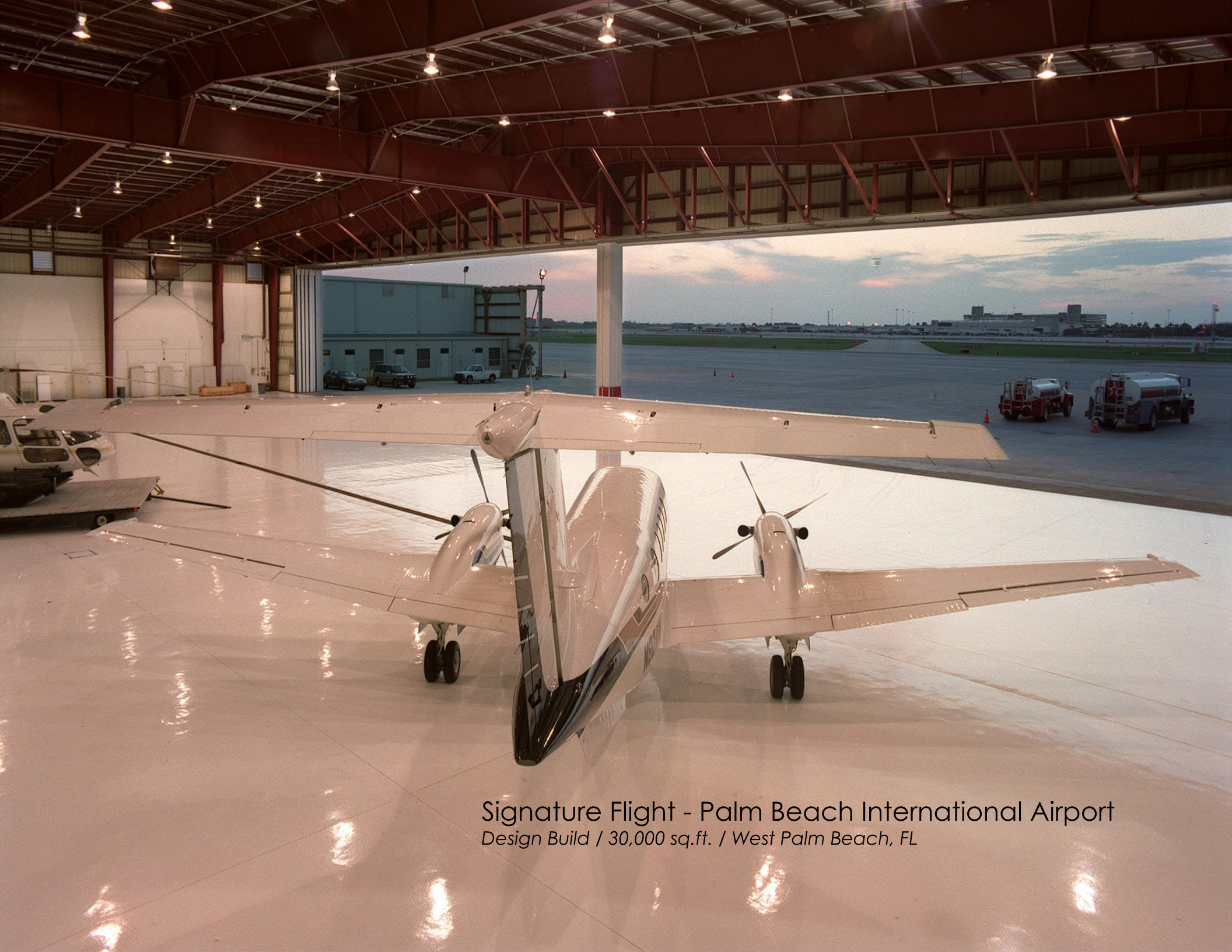
Signature Flight - Palm Beach International Airport Design Build / 30,000 sq.ft. / West Palm Beach, FL