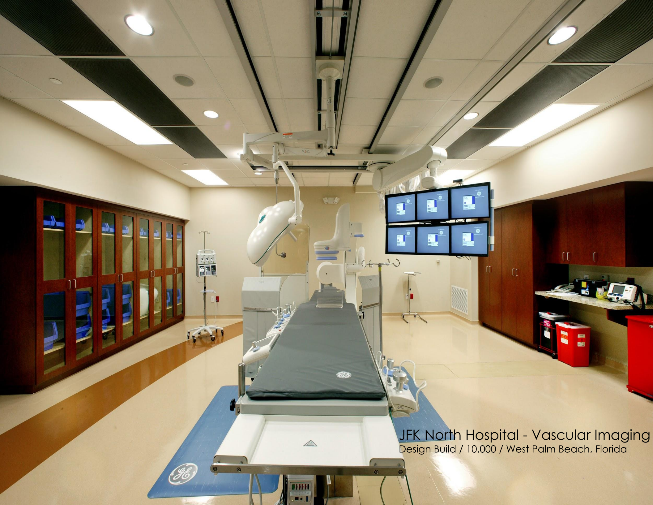
JFK North Hospital - Vascular Imaging Design Build / 10,000 / West Palm Beach, Florida