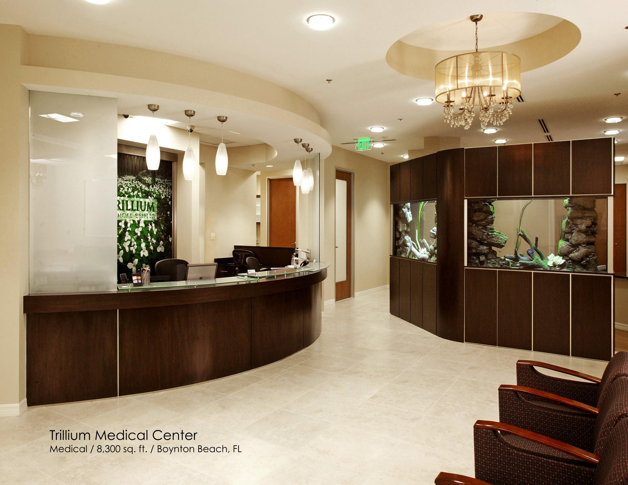
Trillium Medical Center Medical / 8,300 sq. ft. / Boynton Beach, FL