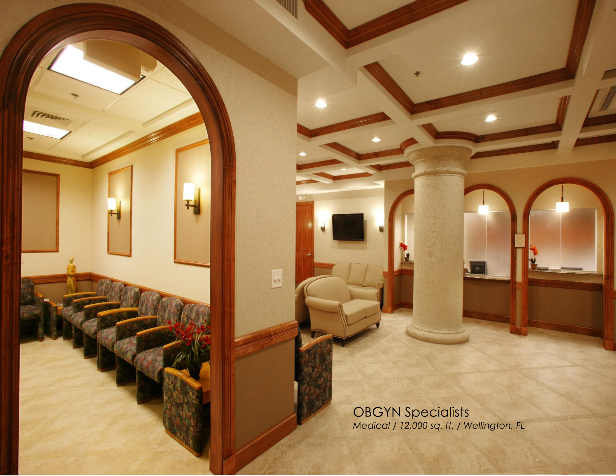
OBGYN Specialists Medical / 12,000 sq. ft. / Wellington, FL