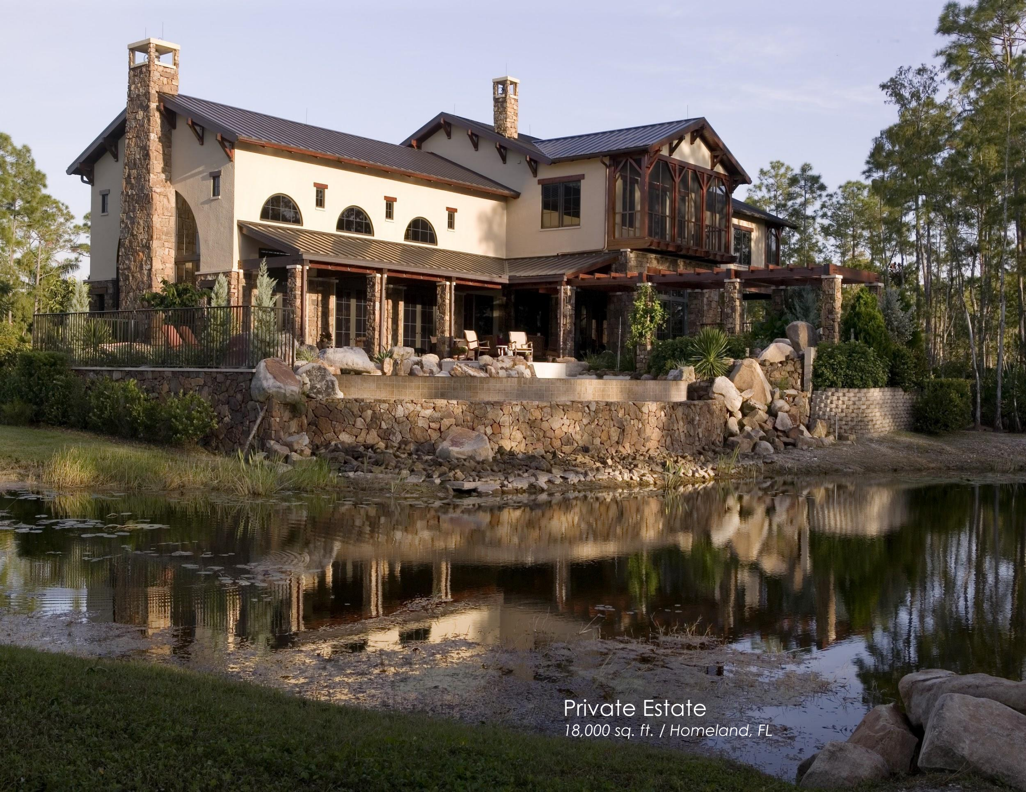
Private Estate 18,000 sq. ft. / Homeland, FL