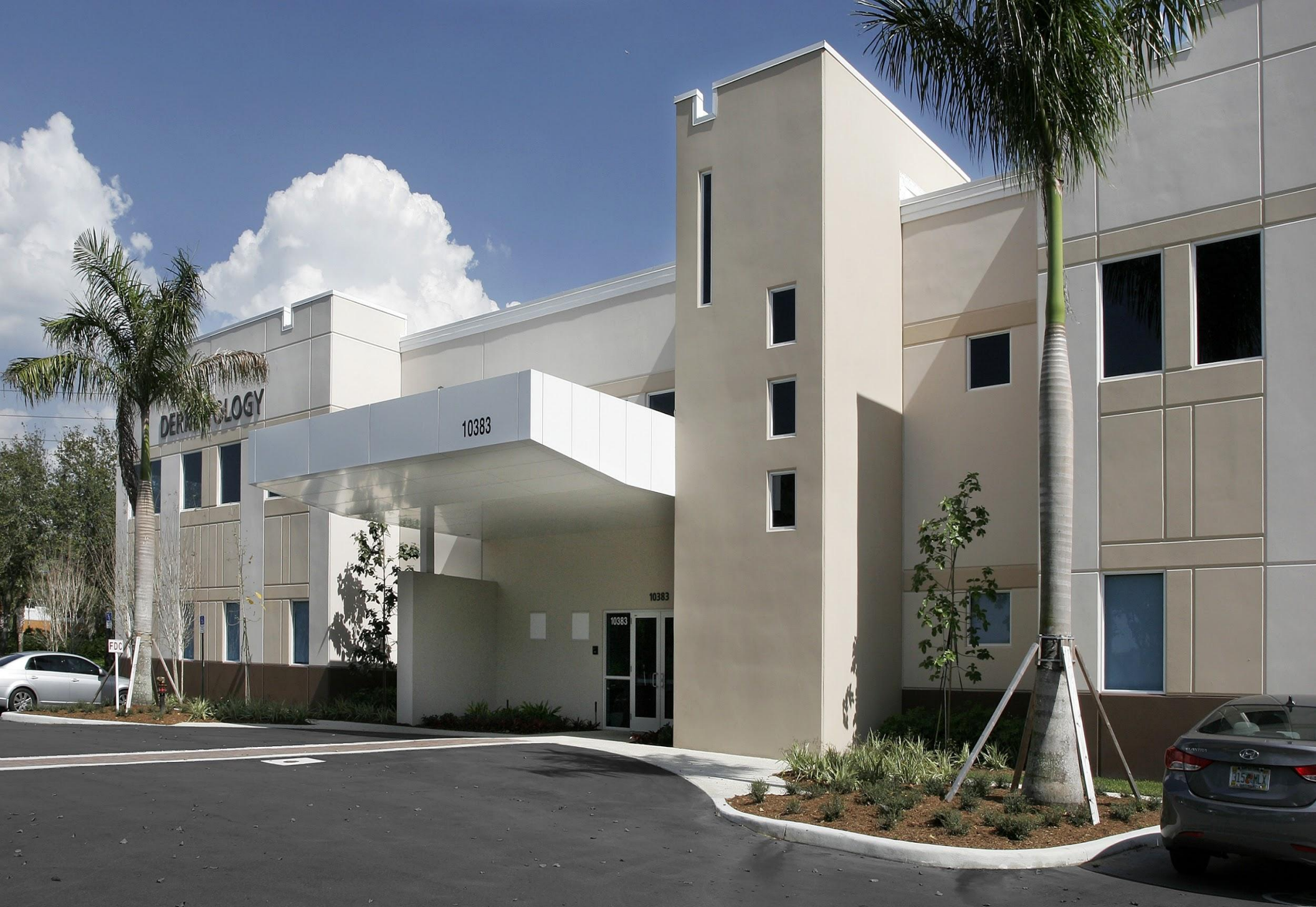
Berlin Dermatology Medical / 18,000 sq. ft. / Boynton Beach, FL