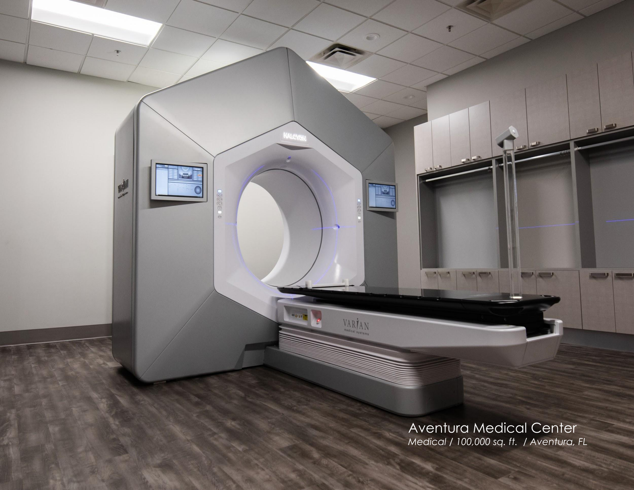
Aventura Medical Center Medical / 100,000 sq. ft. / Aventura, FL