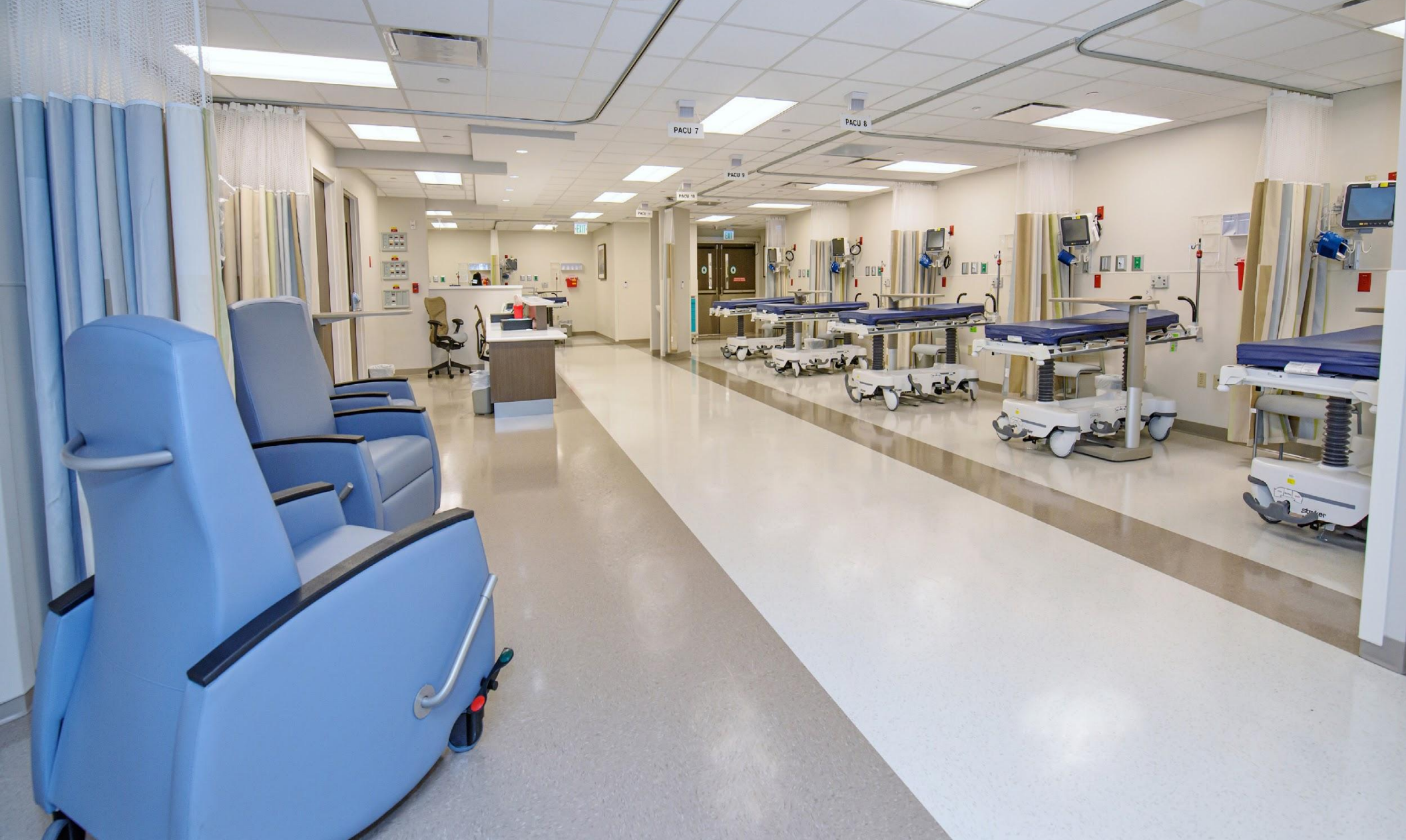
Baptist Health Care Surgery Center Bethesda West Campus Medical / 16,000 sq. ft. / Boynton Beach, FL