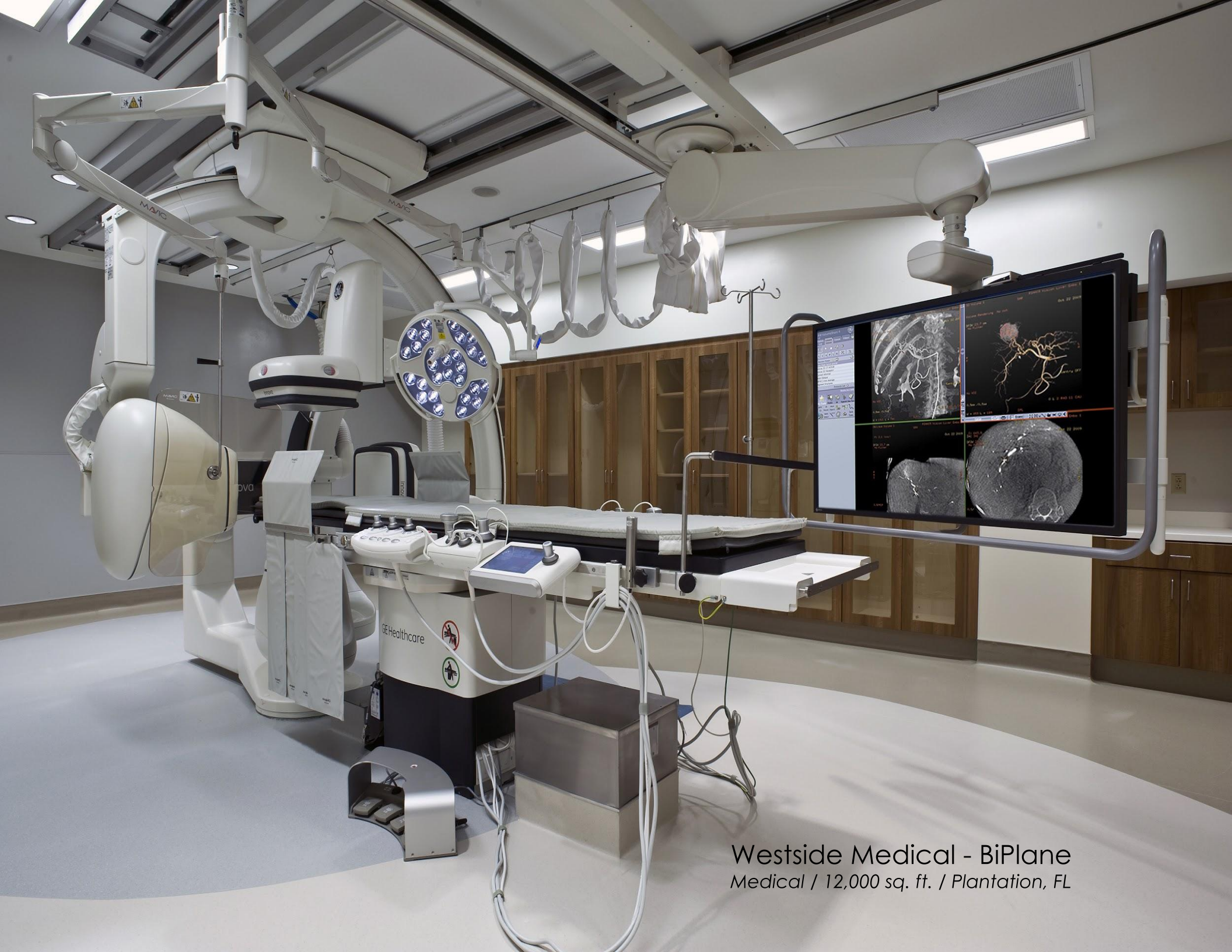
Westside Medical - BiPlane Medical / 12,000 sq. ft. / Plantation, FL