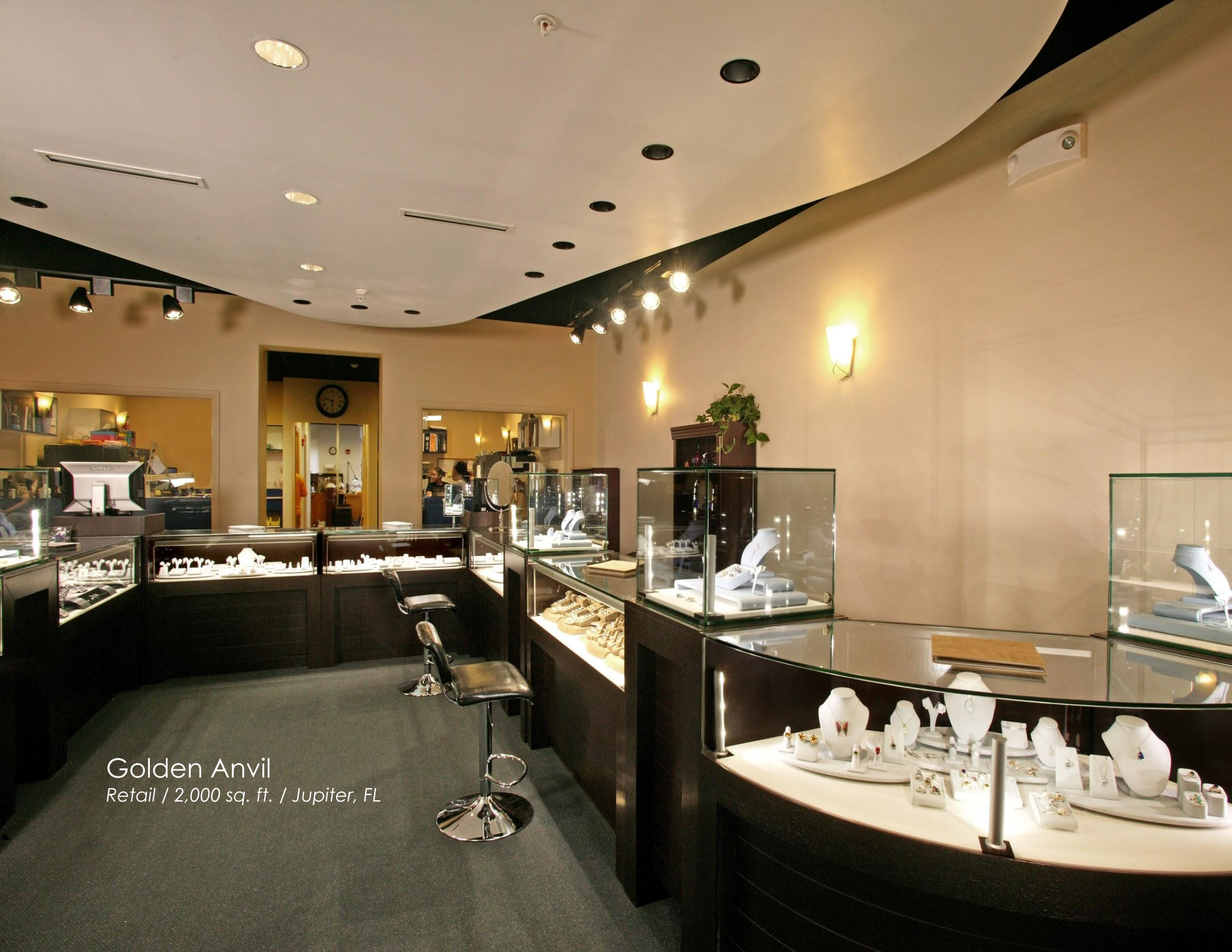
Golden Anvil Retail / 2,000 sq. ft. / Jupiter, FL