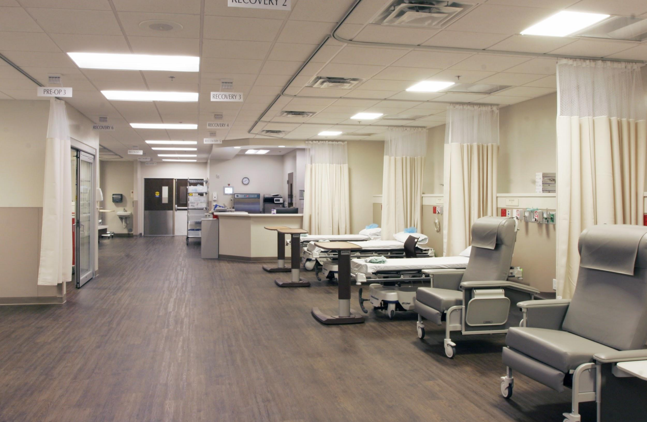
Orthopedic Surgery Center - Bethesda West Medical / 16,000 sq. ft. / Boynton Beach, FL