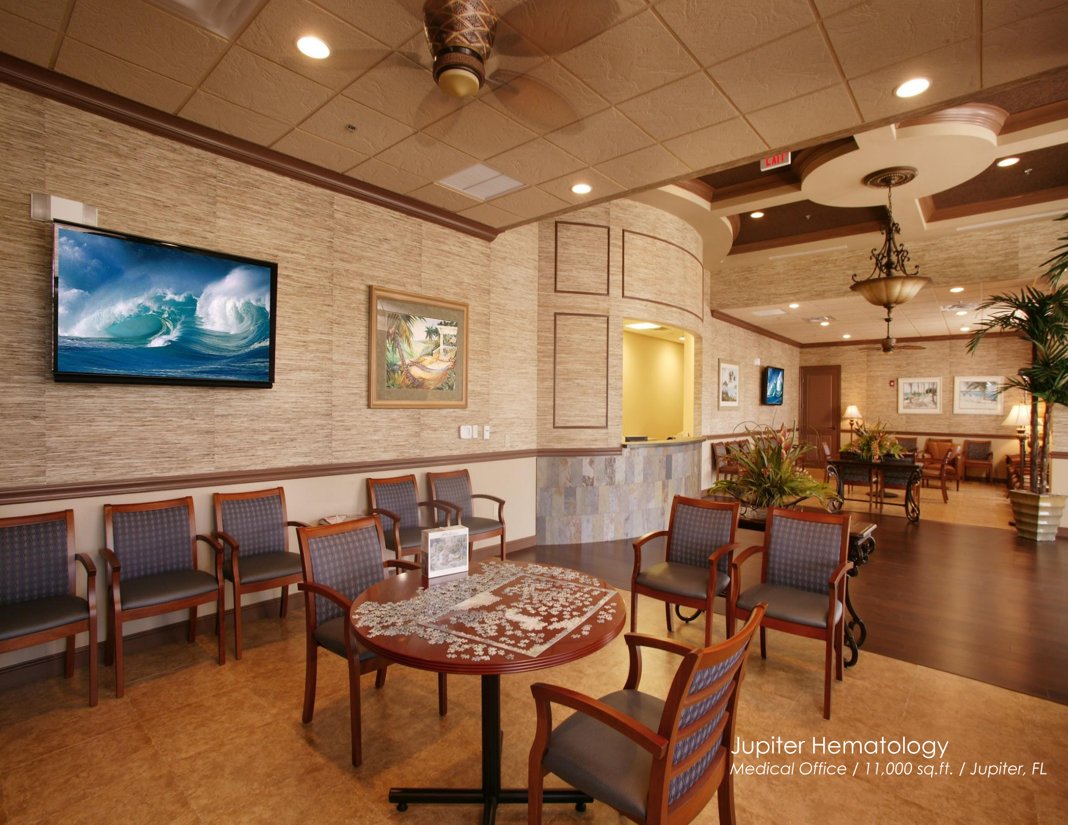
Jupiter Hematology Medical Office / 11,000 sq.ft. / Jupiter, FL