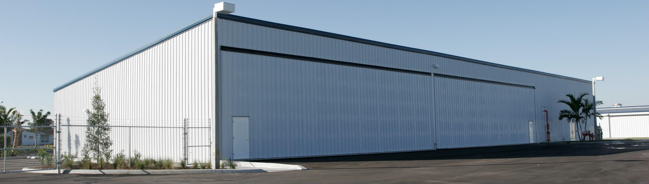
Broward College of Aviation Institute Specialty Build / 12,000 sq. ft,