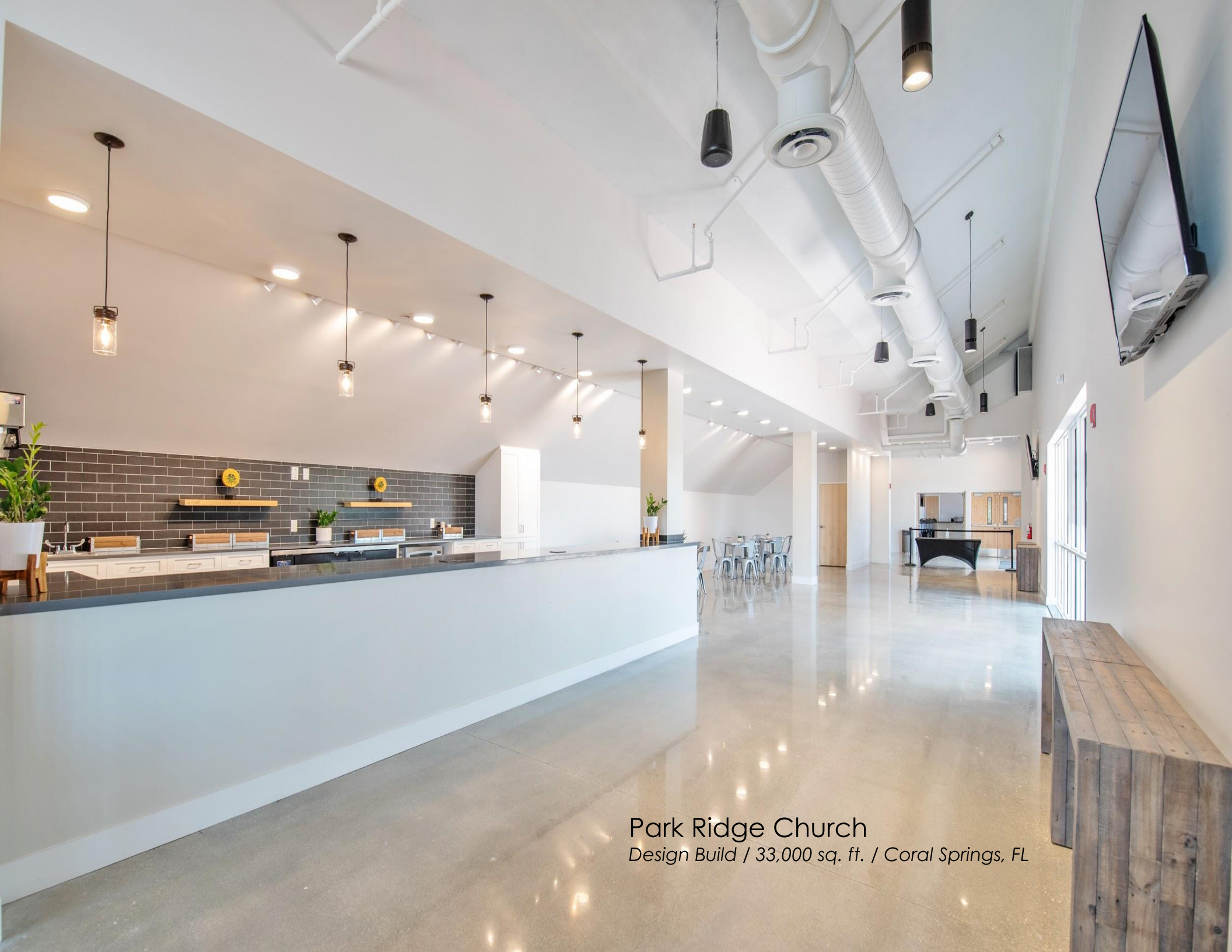
Park Ridge Church Design Build / 33,000 sq. ft. / Coral Springs, FL