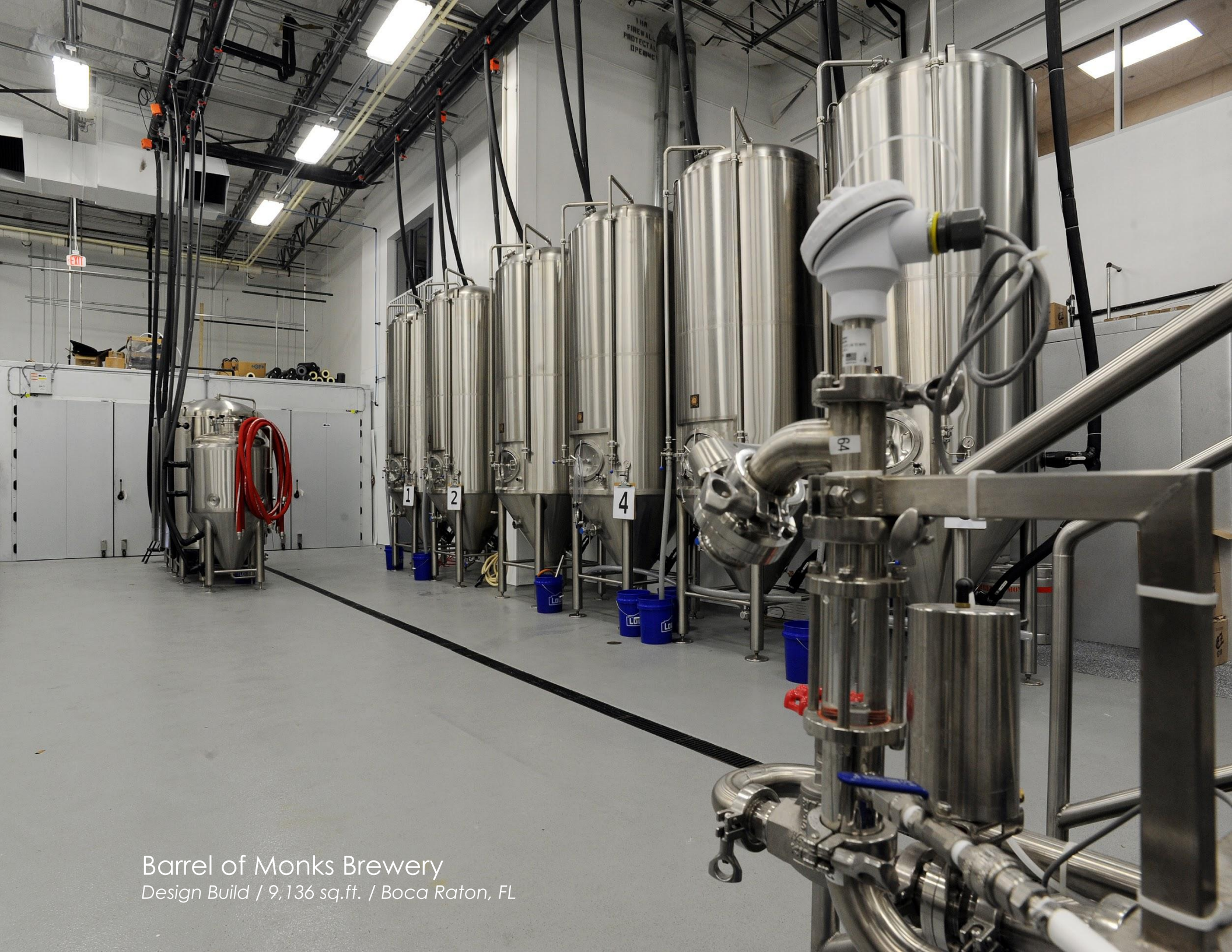
Barrel of Monks Brewery Design Build / 9,136 sq.ft. / Boca Raton, FL